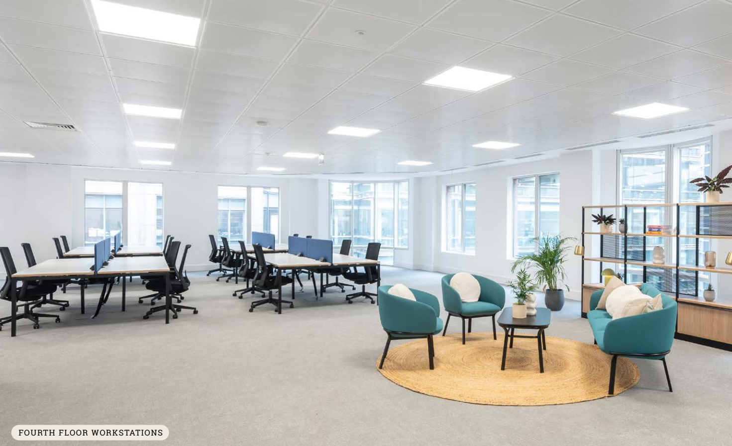
FOURTH FLOOR WORKSTATIONS