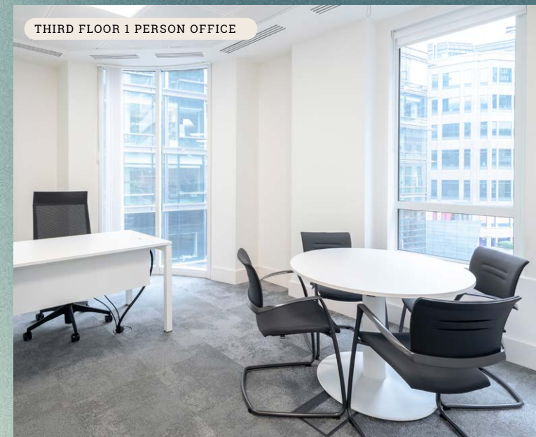
THIRD FLOOR 1 PERSON OFFICE