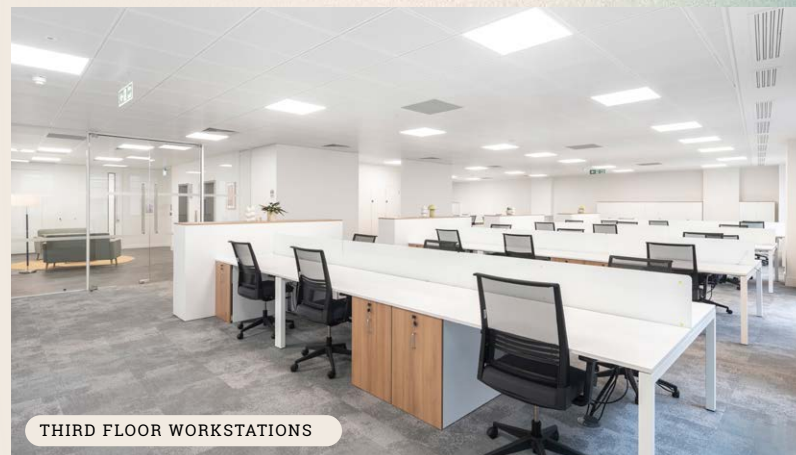
THIRD FLOOR WORKSTATIONS