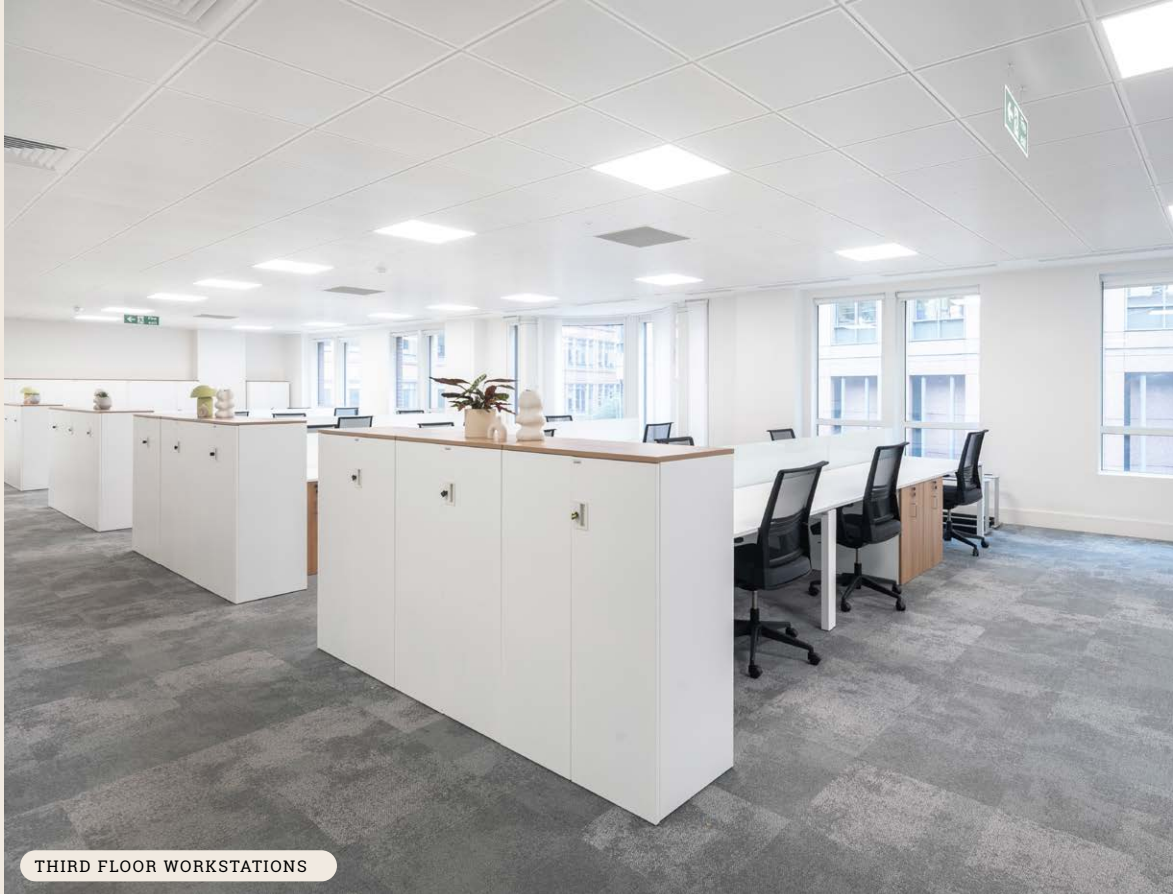
THIRD FLOOR WORKSTATIONS