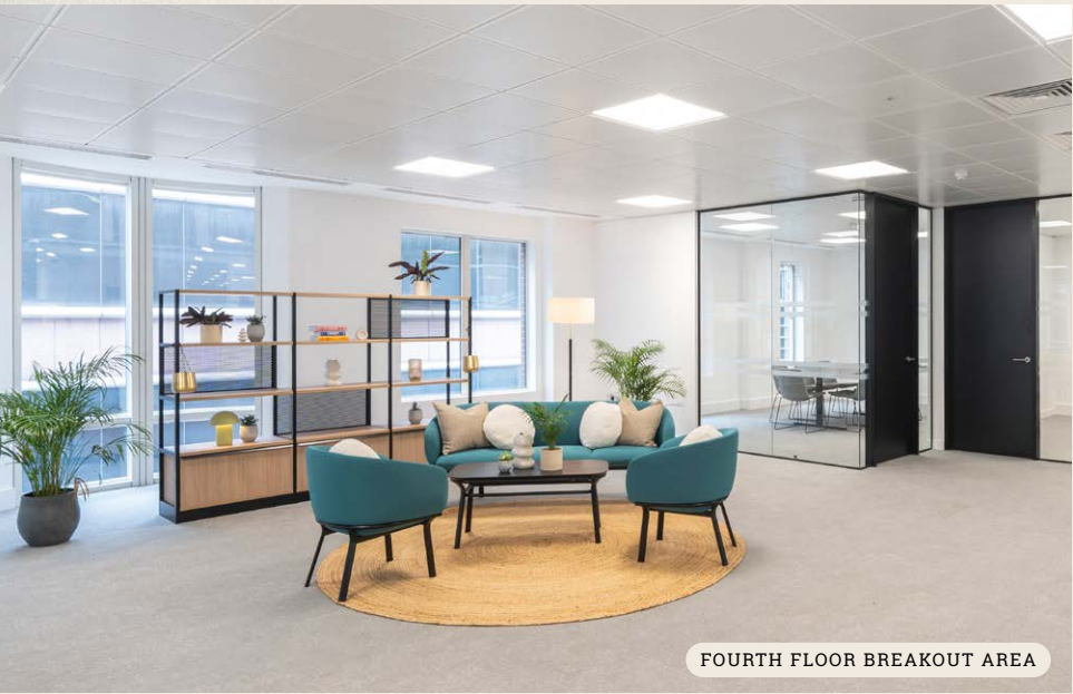
FOURTH FLOOR BREAKOUT AREA

Floorplans not to scale. For indicative purposes only.