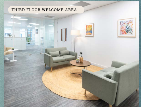
THIRD FLOOR WELCOME AREA