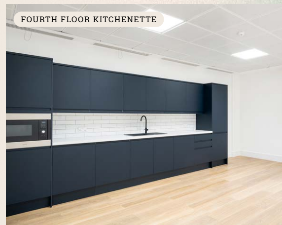
FOURTH FLOOR KITCHENETTE