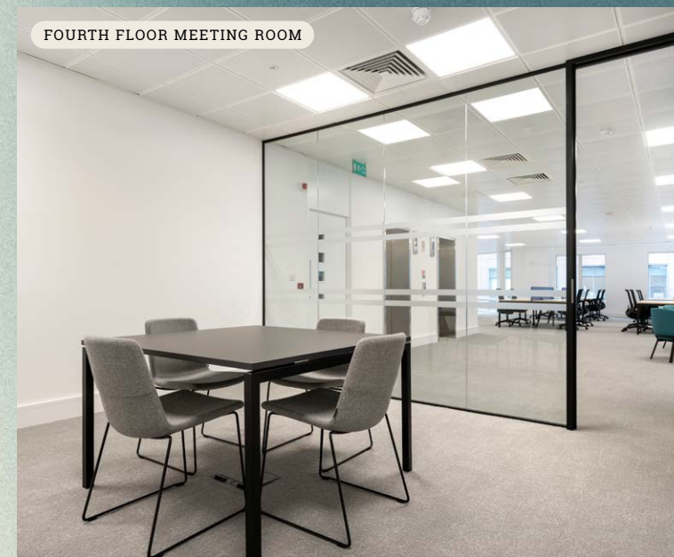
FOURTH FLOOR MEETING ROOM